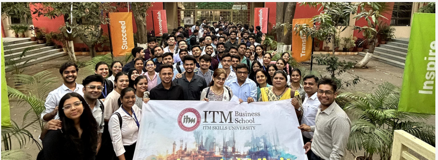
Marketing 2023-25 Mahindra & Mahindra

ITM Business School's PGDM students recently embarked on enriching industrial visits, gaining valuable firsthand experience at leading companies across diverse sectors. The HR batch immersed themselves in the dynamic work environment at JSW Steels , witnessing talent management practices in action. Meanwhile, the Marketing cohort delved into the strategic world of Mahindra & Mahindra , understanding brand building and customer engagement strategies. The Finance batch honed their financial acumen at Telwane Pvt. Ltd. , gaining insights into financial operations and decision-making. These visits provided students with practical knowledge beyond textbooks, fostering connections between academic concepts and real-world applications.