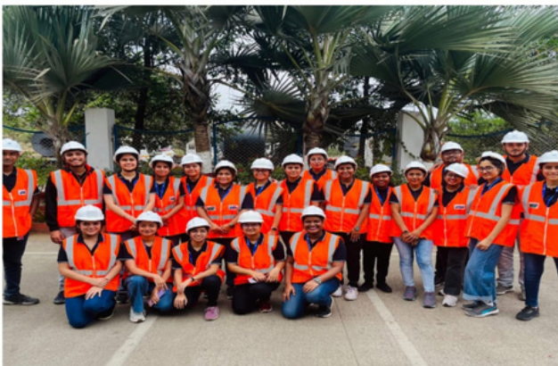
HR, 2023-25 (JSW Steels)