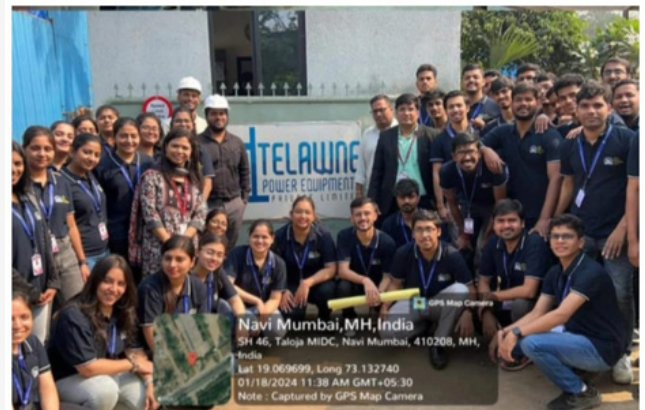
Finance, 2023-25 Telwane PVT.LTD