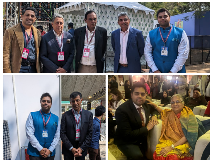
Glimpses from Jaipur Literary Festival

We're thrilled to share that one of our college alumni took center stage as an anchor at the prestigious Jaipur Literary Festival . Their notable presence added a touch of our alma mater's excellence to this renowned literary event. Cheers to our accomplished alumni making waves in the literary world!